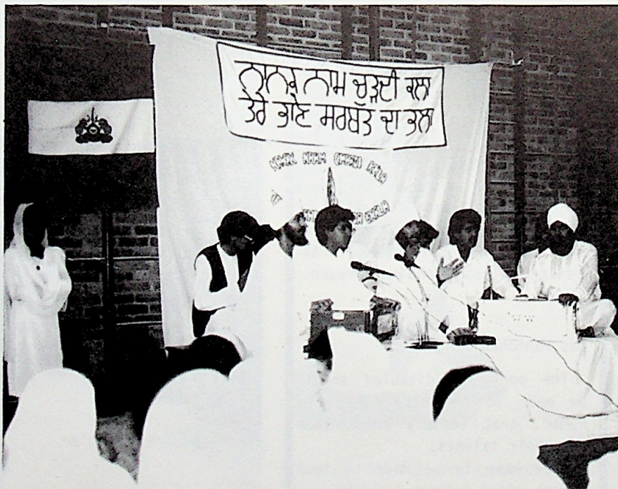
Young singers from Birmingham.