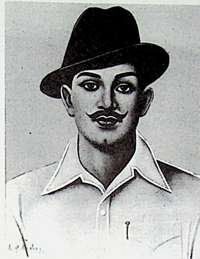
Bhagat Singh - died for the liberation of his country.