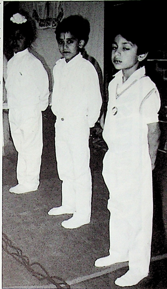
Young members on duty.