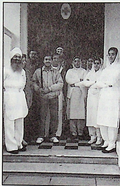
Some of the walkers at the entrance to the Red Cross headquarters in London after completing the walk.