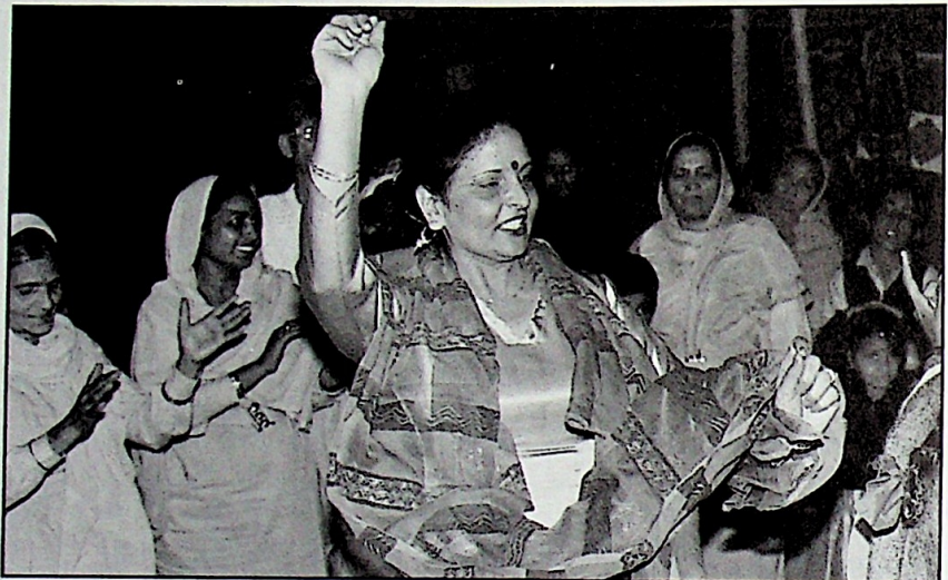
Dancing the Bhangra at Khayala Darshan Darbar.